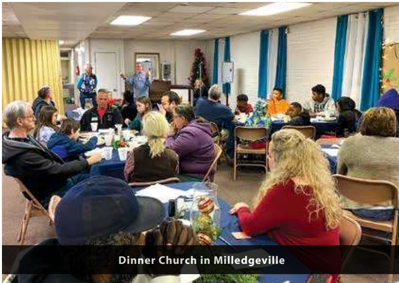
Dinner Church in Milledgeville