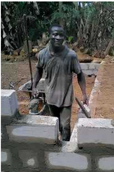
House-building in progress in Liberia

Please call the CBF/GA office at 478-742-1191 with any questions.