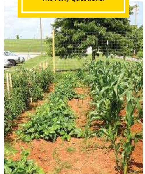
Community garden being redesigned in Cartersville