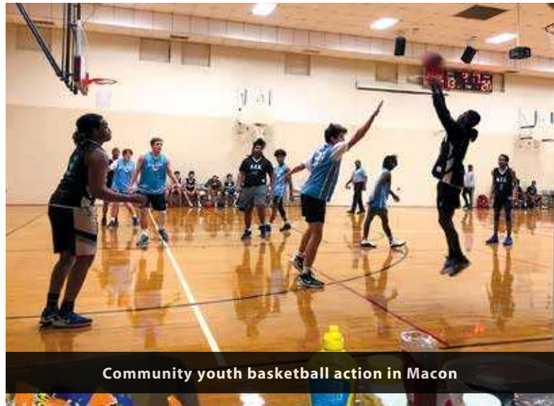
Community youth basketball action in Macon