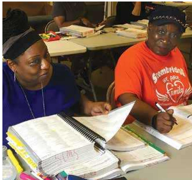
Studying in medical coding class in Atlanta