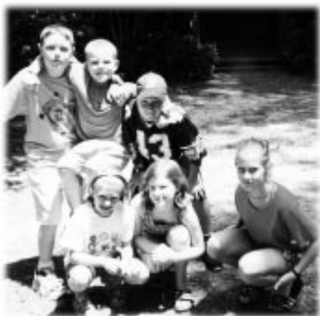
Campers pause from play at New Horizons 1998.