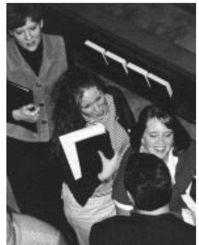
Columbus First Baptist Church made CBF of GA feel right at home!