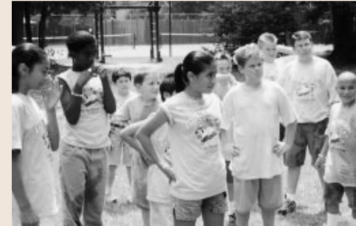
Campers listen intently to directions given by their counselor during New Horizons Camp, July 27, 1999. New Horizons Camp, near Savannah, is held annually for children who have completed grades 3-5.