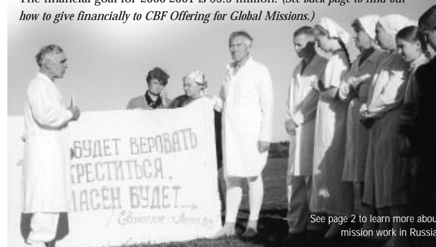
See page 2 to learn more about mission work in Russia.