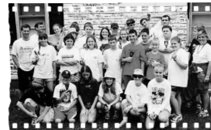
With paintbrushes in hand, PASSPORT campers pause from their busy work for a group photo. 407 Georgia youth attended PASSPORT camps in summer 1999.