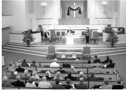
Business session on Friday evening