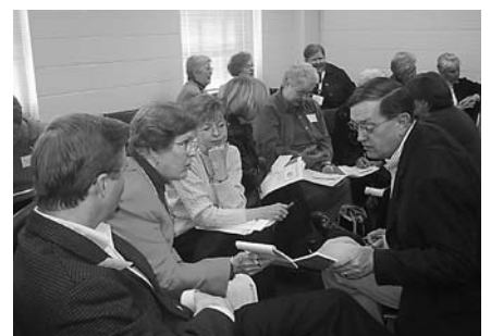
Speaking the Truth seminar participants