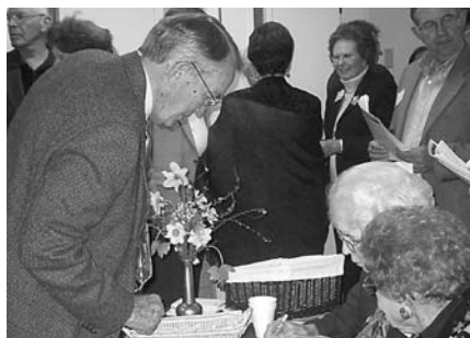
Registration staffed by FBC Rome volunteers